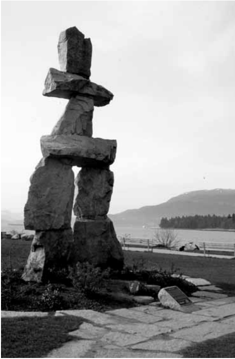
The Inuksuk at English Bay, Vancouver, British Columbia